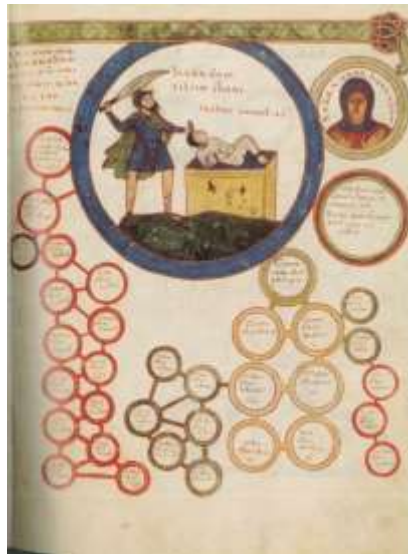
Figure 3: Généalogie d’Abraham , miniature, Saint-Sever, XIe siècle, from the Commentaire de l’Apocalypse of Beatus de Liebana, Paris, BNF, lat. 8878, f°8. Compare with Buffon’s genealogical tree.