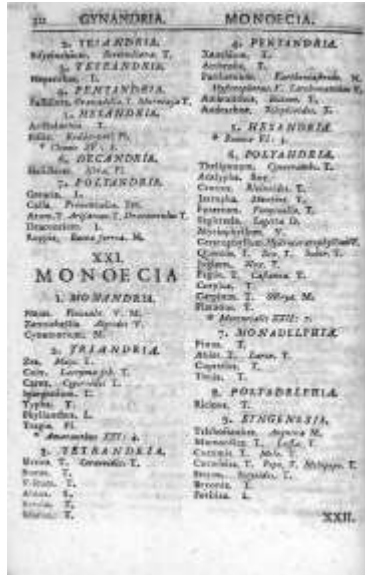
Figure 1: Linnaeus, Systema naturae , 2 d ed., Kiesewetter, 1740. Illustration of classificatory style.